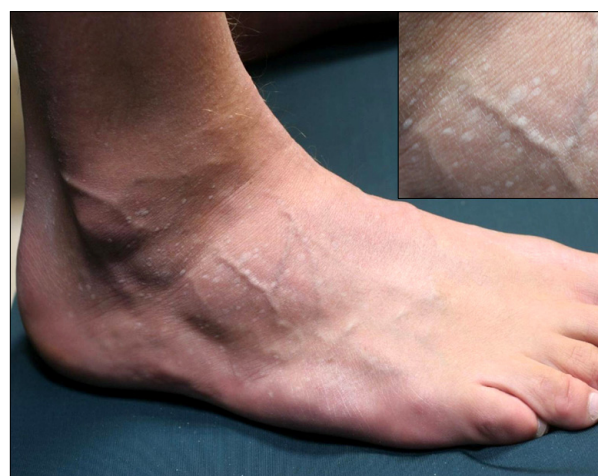
Fig. 1. Multiple asymptomatic hyperkeratotic, whitish papules measuring 0.2~0.3 cm on both shins and dorsum of the feet.

We herein report on a rare case of AKV, which developed in a middle-aged person without familial history.