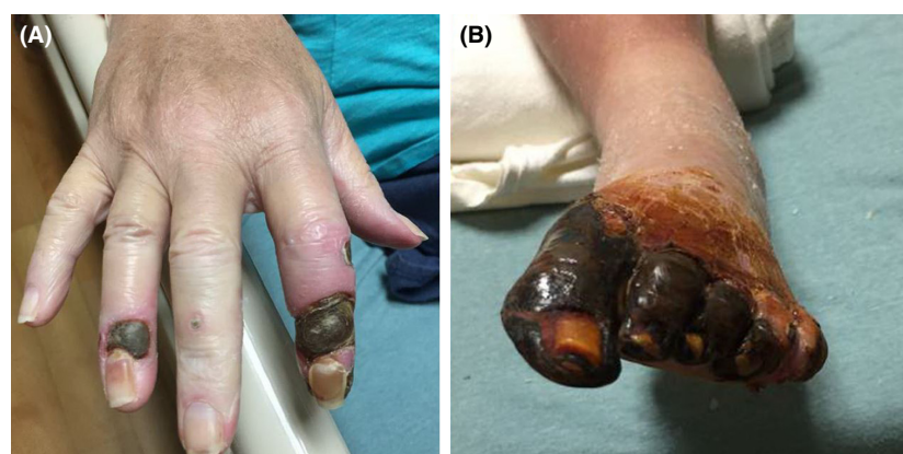
Figure 1. Necrotic lesions surrounded by erythema on the fingers (A) and toes (B) of the right hand and left foot, respectively.

parathyroid hormone (PTH) 348 pg/mL (150–300 for ESRD). Her PTH was apparently “very high” several months ago. X-rays of the hand and foot revealed extensive arterial calcifications suggestive of calciophylaxis (Fig. 2). Risk factors for calciophylaxis include high calcium-phosphate product, elevated PTH, hypoalbuminemia, diabetes, obesity, warfarin use, female sex, and protein C or S deficiency. Most lesions occur in legs though uncommon sites such as breast have been reported [1]. It has been proposed that calciophylaxis and