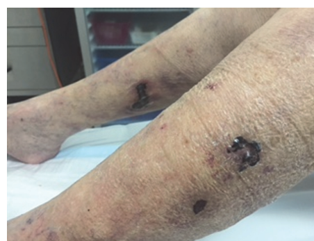
FIGURE 1: Necrotic ulceration on lower legs.

The patient was commenced on doxycycline 50 mg/day and was given an infusion of Zoledronic acid 5 mg. Warfarin was ceased and the patient was commenced on rivaroxaban.