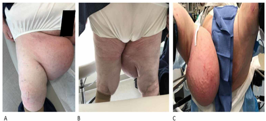
FIGURE 1: Large adiposis dolorosa on medial aspect of right thigh

Her past medical history was significant for hypertension and obesity. Her physical examination revealed a very large mass protruding from the right medial thigh, measuring more than 40 cm in its greatest dimension (Figure 1). The color and texture of the overlying skin were normal and without ulcerations. The contralateral thigh was normal for her body habitus. Laboratory studies, including complete blood count and basic metabolic panel, were within normal limits. Based on the size of the mass and physical characteristics, our differential diagnosis included a large lipoma versus a sarcoma. An MRI with and without gadolinium had been obtained by the general surgeon and revealed a very large superficial exophytic mass in the right medial thigh with characteristics most suggestive of adiposis dolorosa (Figure 2).