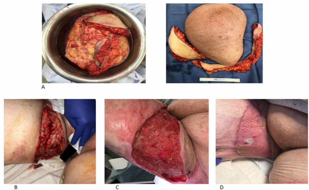
FIGURE 3: Intraoperative and postoperative images

A: resected tissue; B: large defect after resection of the lesion; C: wound bed 18 days after VAC therapy with healthy granulation tissue; D: well-taken STSG seven weeks after the initial surgery