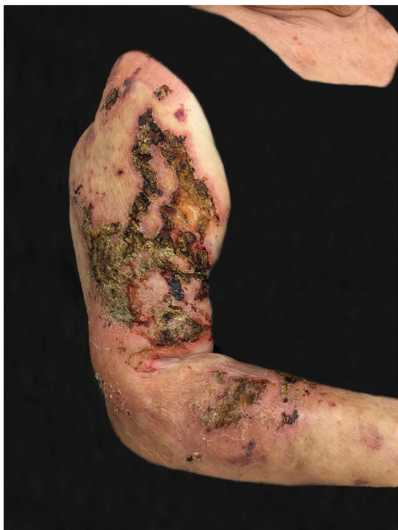
Figure 1 Paracoccidioidomycosis: ulcerative-necrotic, phagedenic lesions, with areas covered by crusts, affecting the right arm and forearm.