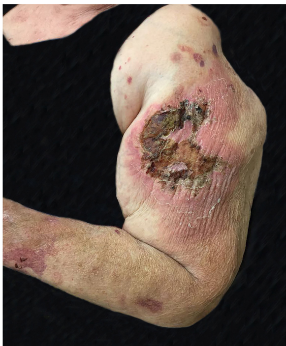
Figure 2 Paracoccidioidomycosis: extensive ulcerative necrotic lesion, areas covered by crusts and with an intense inflammatory halo. Papules and satellite plaques, located on the left arm and forearm.

hypothesis was primary cutaneous cryptococcosis, due to the inflammatory aspect associated with necrosis, localized in exposed areas; however, the bilateral aspect of the lesions did not correspond to this hypothesis. Biopsies and laboratory investigation were performed; the final diagnosis of paracoccidioidomycosis was surprising and confirmed by histopathological examination (Figs. 3 and 4) and direct mycological examination. Complementary tests, including chest and abdominal computed tomography (CT), ruled out involvement of other organs. Laboratory tests revealed elevated CRP and glycemia, negative HIV and anti- P. brasiliensis serology, and negative culture for bacteria and fungi. The clinical response was complete after treatment with itraconazole 400 mg/day in the first month, decreased to 200 mg/day until the sixth month of treatment.