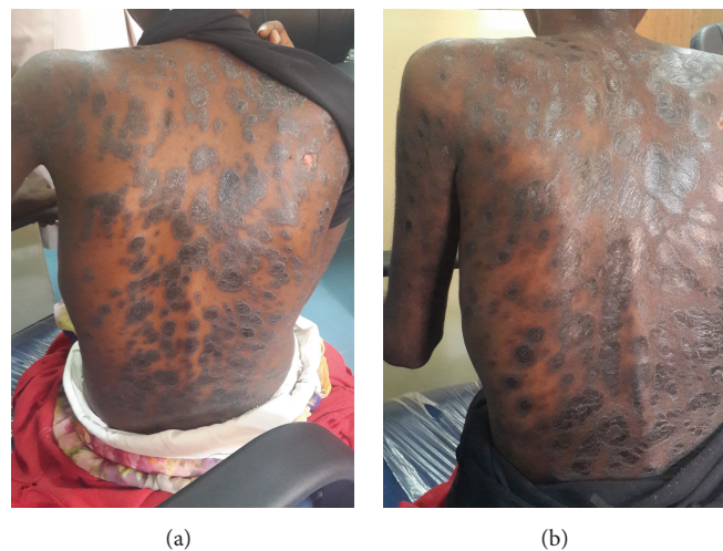
FIGURE 1: (a) Hyperpigmented plaques (elevated lesions) seen before commencement of treatment; (b) shiny hyperpigmented patches (flat lesions) of postinflammatory hyperpigmentation seen after 3 months of antifungal treatment.